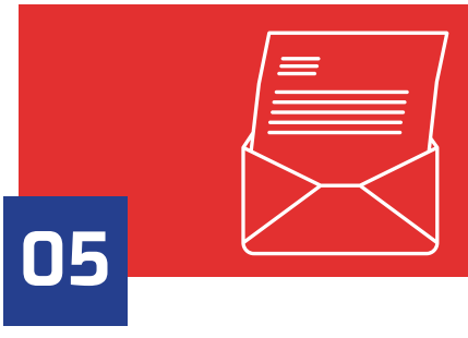
Receive our Conditional/ Unconditional Offer.