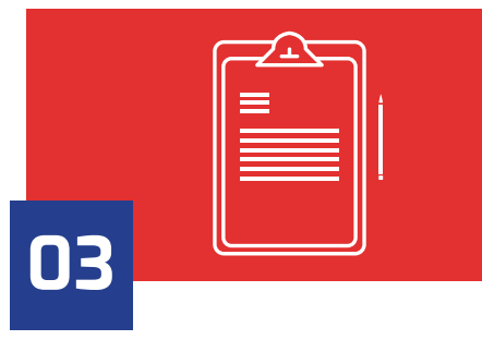
Complete the relevant course application form.