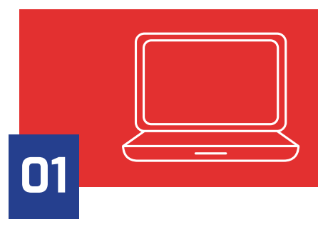
Find out about the Courses that are on offer.