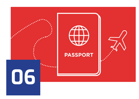
We will issue you with a CAS* to allow you to apply for your Visa**