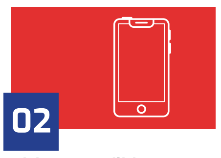
Visit AST Facilities or Contact AST for more information.